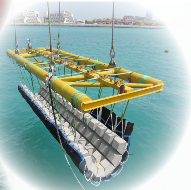
Quaywall Protection & Stabilisation