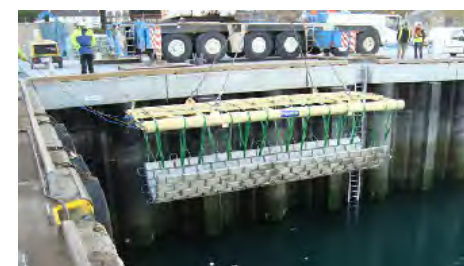
Port & Harbours

Pipeshield have a wide range of fabric formwork solutions for specific applications. We can also provide sand, gravel and grout bags in bulk quantities and supply in bags ranging from 25kg bags to the most common being a 1Te offshore rated bulk-bag with a minimum safety factor of 10:1.