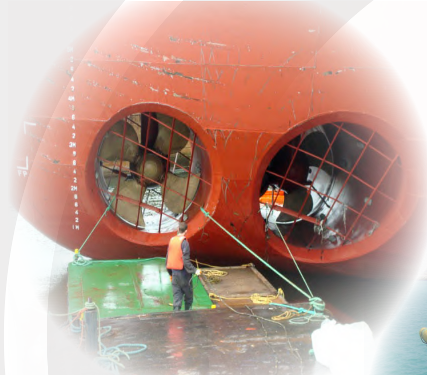
Protection from Bow Thruster & Propeller Scour