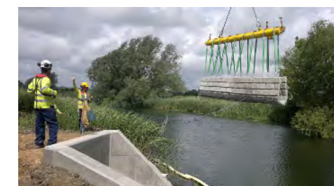
Rivers & Waterways