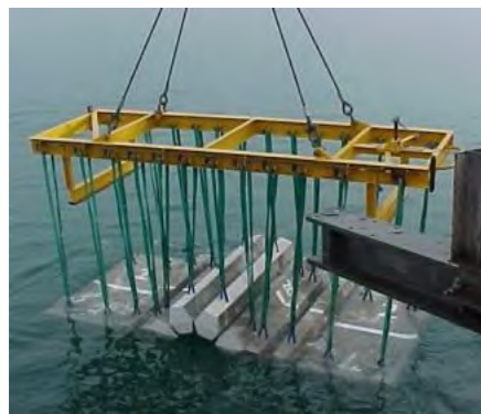
Deepwater Frame deploying Uni-Flex mattress with anchoring attachments

Lifting equipment has been designed, manufactured and tested in accordance with DNV standards to provide correct lifting arrangements of all our products enabling safe and reliable deployment.