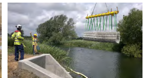
Rivers & Waterways